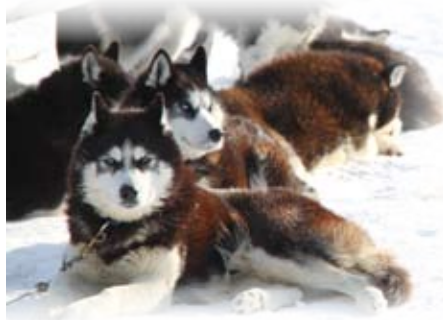
Huskies waiting patiently for their race at the Didsbury dogsled race on a very cold day.

Our mission is working to provide opportunities for members to enhance profitability and competitiveness through genetic improvement programs delivered effectively and efficiently. Please feel free to contact us with any of your questions and concerns.