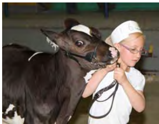
Great effort from all Pee Wees at various shows