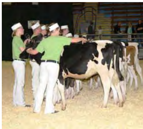
Green Acres 4-H Club Achievement Day