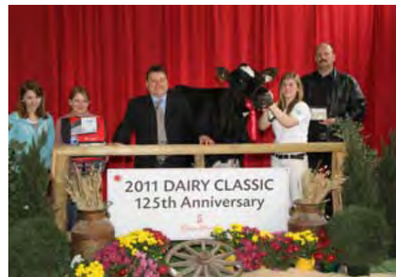
Skycrest Lou Lip Smacker

Skycrest Dundee Nutmeg, Skycrest Holsteins, AB