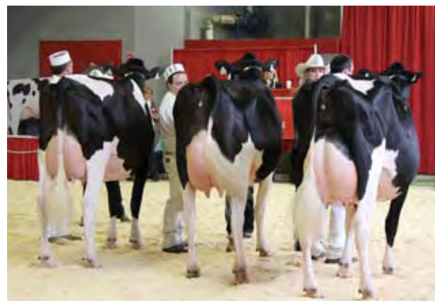
The Three Leading Ladies