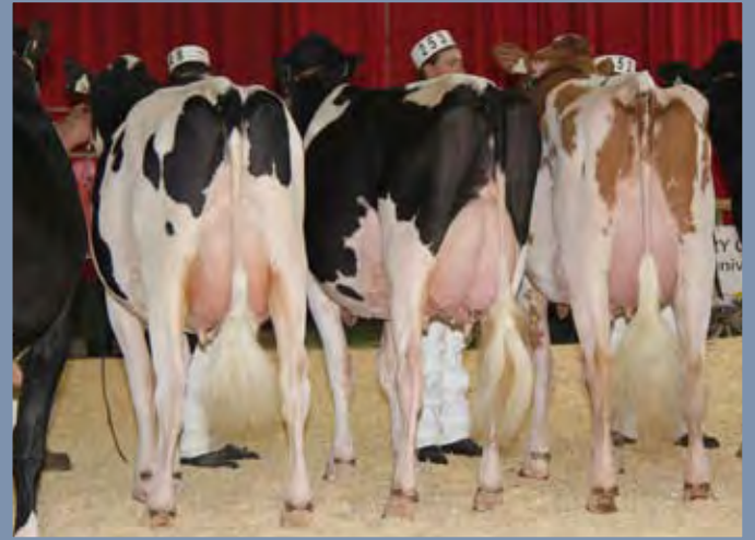
Calgary Classic Show - Judge Pierre Boulet